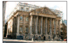
The historic Mansion House, a world-renowned fulcrum of both good governance and splendid pageantry